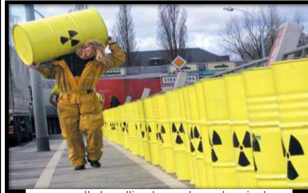
manually handling hazardous chemicals