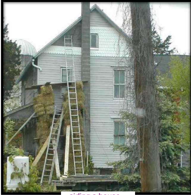
siding a house...